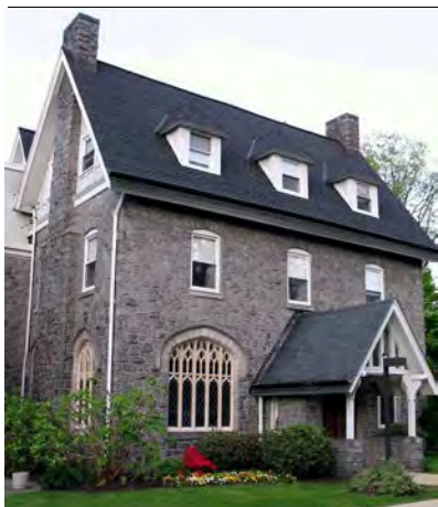
Historic chapel at New Seasons in Devon, site of Abigail Adams spring lecture.

For further information about the Tredyffrin Historic Preservation Trust, please visit their website, www.tredyffrinhistory.org