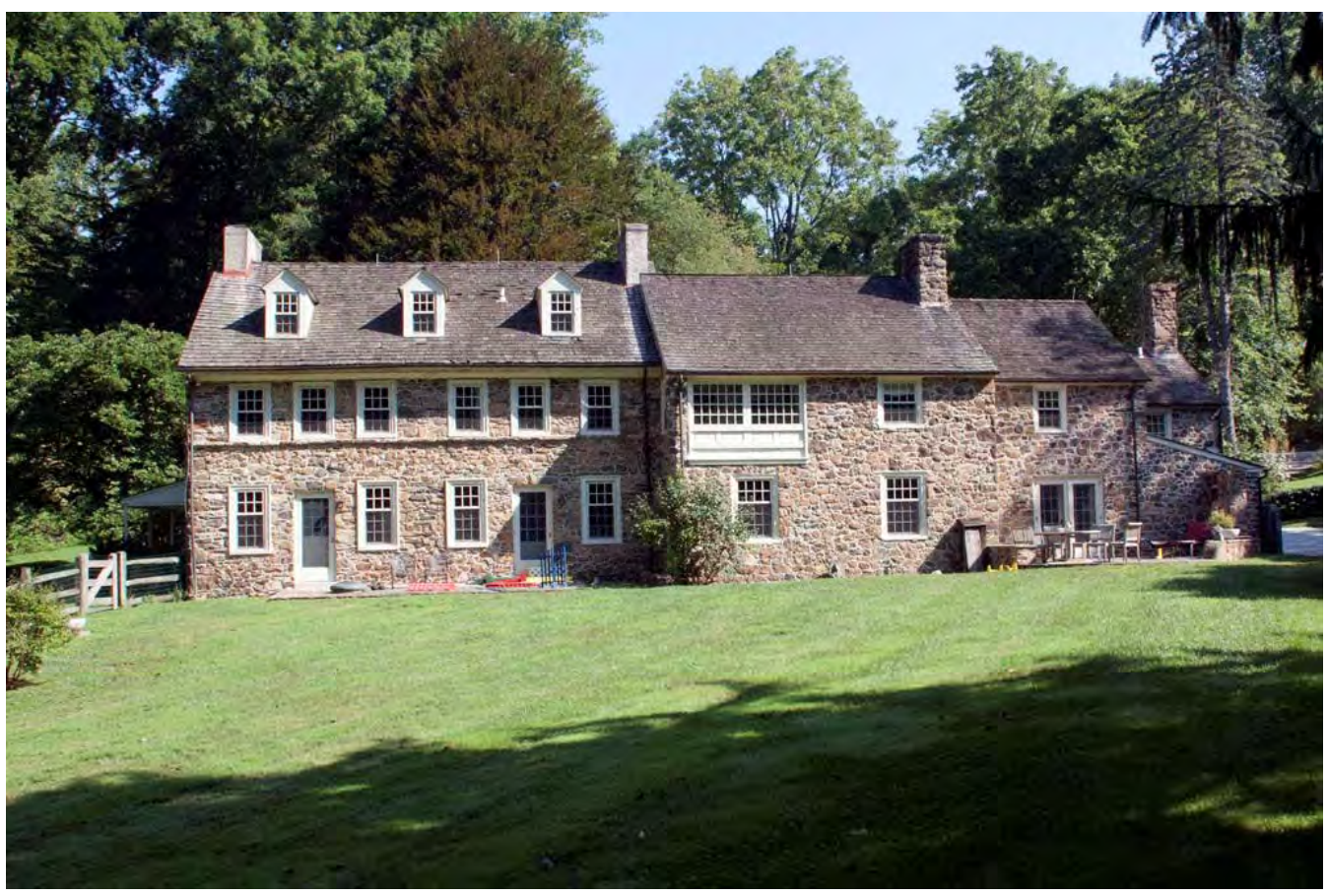
The miller's residence has been restored and is occupied today by the property owners.

In colonial times the miller typically did not own the mill. He leased it from the owner of the property. The miller typically employed several indentured servants to help him with the operation of the mill. Some of these servants apparently did not care for the working conditions at the mill. Grubb's Mill is recorded in history by an inordinately large number of newspaper advertisements seeking the return of runaway servants.<sup>9</sup>