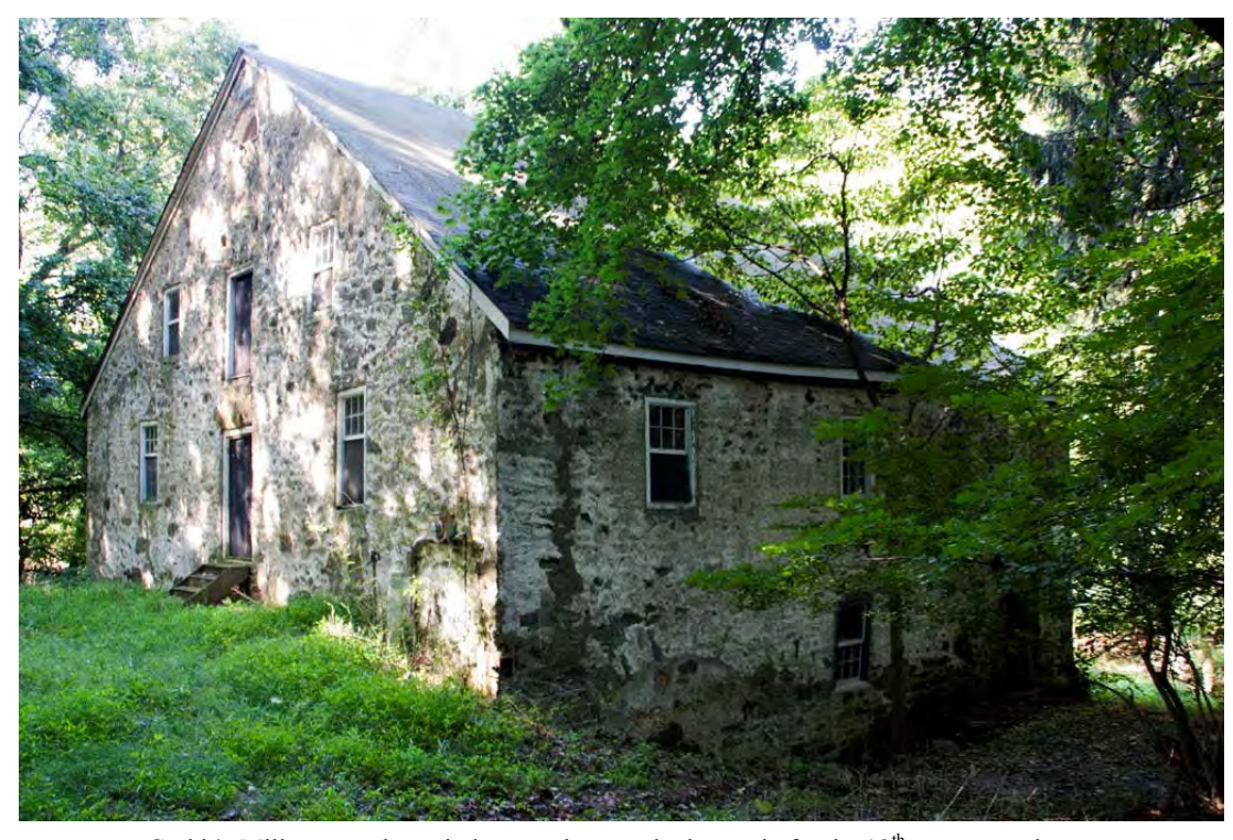
Grubb's Mill was used to grind corn, wheat, and other grain for the 18<sup>th</sup> century settlers.

Grubb's Mill on Grubb's Mill Road is a handsome stone building. Na-