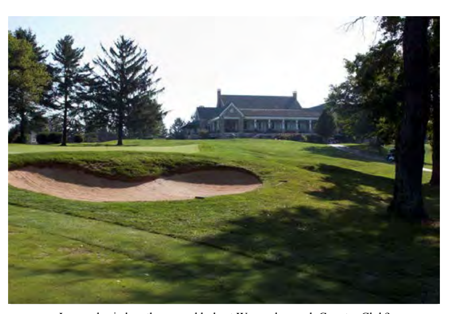
Is a car buried on the second hole at Waynesborough Country Club?

Waynesborough Country Club was founded in 1965, thus preserving one of the most beautiful historical properties in Chester County. Six other golf courses in the Crum Creek