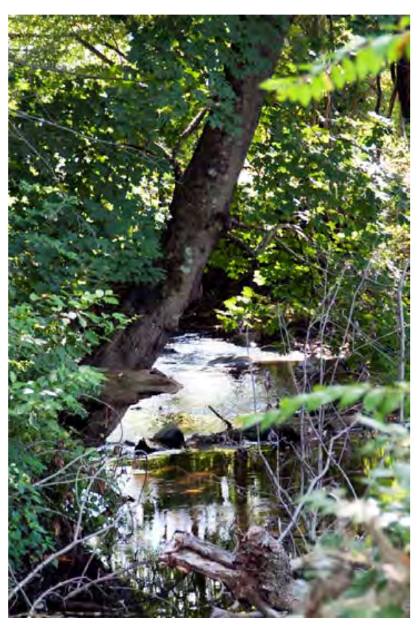
A rope extending from a tree branch carried swimmers from the bank to the middle of the sheephole for a refreshing summer dip.