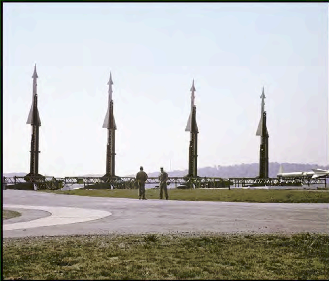
The Paoli / Valley Forge Nike Missile Base

When the Cold War Cast Its Shadow upon the Great Valley